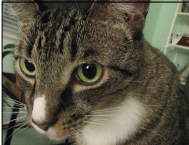
Tiger Tom's adopter was captivated by his eyes.

Has a situation you faced ever required you to act in a way, for your own good, that was very different from the way you really felt inside? Maybe you were at a party where everyone was celebrating and having fun but you felt like crying because of something that was going on in your life at the time. Somehow, you may have managed to suck it up, mingle and smile.