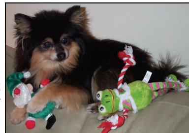
Dozer's first "real" Christmas in a home full of love and toys.